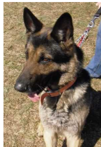
A dog like BOOKER